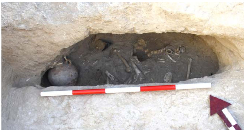
Figure 6. Burial G-2 from trench C.

least four complete vessels. This grave was likely re-opened on several occasions and the bones of previously buried individuals were partially removed to make space for a new body. The final disturbance of an almost complete skeleton on the top may have been the result of looting. In G-2 at least two skeletons were buried; the lower one was partially articulated and covered by a heap of disarticulated bone. The grave goods included nine vessels—a big jar, a plate and small bowls—several bronze ornaments and beads as well as cranial fragments of a young ovicaprid (Figure 6). Finally, G-3 was a single grave with one articulated skeleton and four complete vessels. Articulated individuals were buried in a flexed position, on their left side and facing southwest.