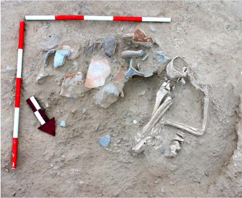
Figure 5. Burial G-3a from trench B.

individual was found with some pot sherds and ornaments including a necklace with different kinds of beads and a ring on the left second finger.