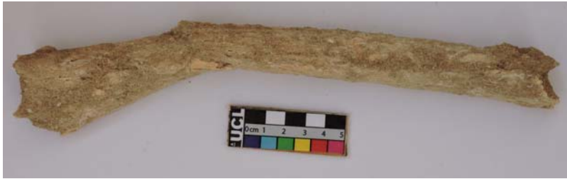
Figure 3. Evidence of trampling in trench B, G-2.