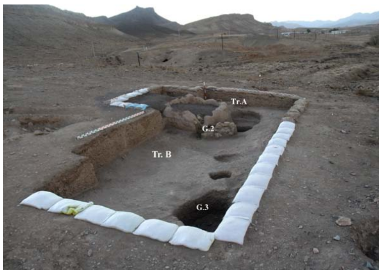
Figure 1. Locations of graves excavated in 2017, Trench B.

During second season of excavations at Estark (34°01'24''N, 51°13'51''E) in September and October, 2017, three parts of the cemetery were investigated: an extension of the 2016 operation (cf. Sołtysiak et al. 2016; Hosseinzadeh et al. 2017), labelled as trench B ( Figure 1 ), a new operation in the eastern part of the cemetery (trench C, Figure 1 ), and a few small test trenches in the south with no evidence of burials. All burials were dated based on pottery comparison to the Iron Age II and perhaps to the very beginning of the Iron Age III. In addition to excavation, a survey in the Rahaq valley was carried out, revealing more Iron Age cemeteries around the village of Estark and Joshagan.