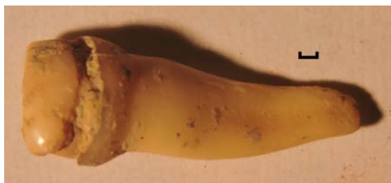
Figure 4. Damaged central deciduous incisor of the child from Room 3. Scale bar 1 mm.

(including 5 per 11 molars) and lesions were located both on cemento-enamel junction and on the occlusal surfaces of molars, which suggests a diet rich in fermentable sugars (cf. Sołtysiak 2012).