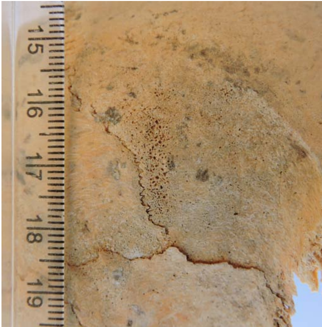
Figure 3. Cranial porosity on the skull from Room 1.