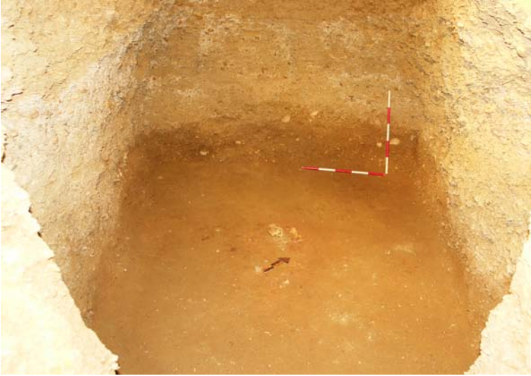
Figure 2. Original position of the skull on the floor of Room 1.