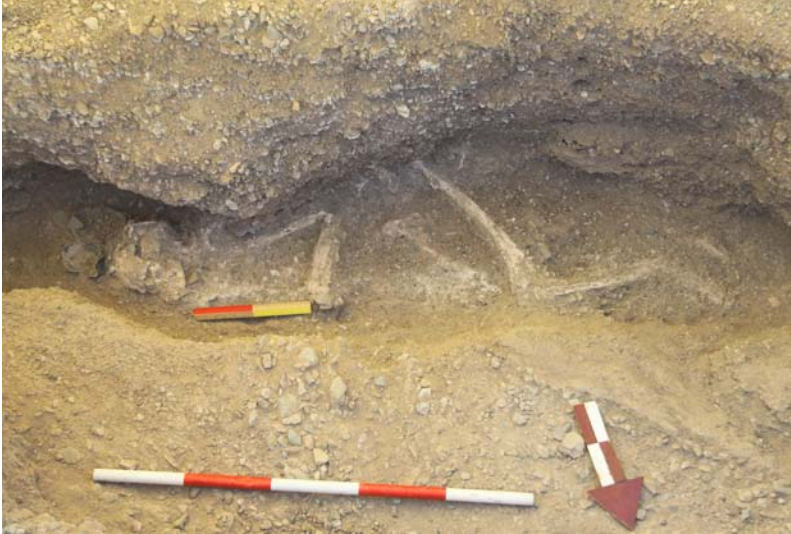
Figure 3. Burial G-2, Trench A.

czak et al. 2018). Furthermore, next to the skull several vessels were deposited, one of which contained animal bones (possibly goat or sheep) in a disturbed anatomical order. Beneath the vessels, a simple metal dagger was placed (Figure 5).