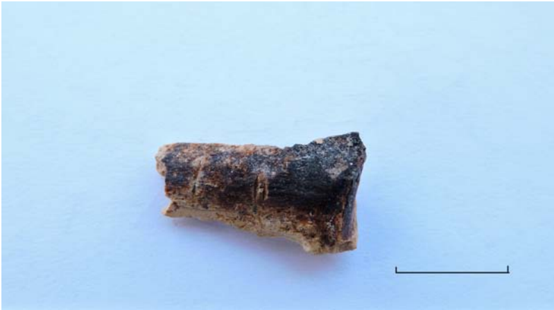
Figure 4. Hand phalanx with black staining and cutmarks, burial G-1, Trench A. Scale bar 1cm

Even though the cemetery of Estark 2 was recently looted, both grave 1 and 2 were not disturbed by contemporary robbers. However, while grave 2 seems to have