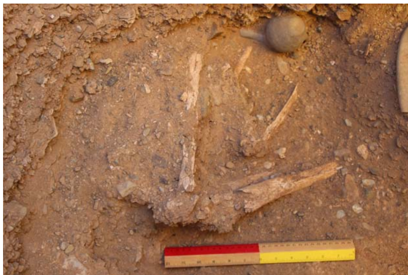
Figure 2. Partially articulated human remains from burial G-1, Trench A.

Grave 1 contained the remains of an adult individual, however the bones were too eroded to assess sex or precise age-at-death category. The burial pit was placed on the NW-SE axis. Only the bones of the left humerus, radius and ulna were in anatomical order, in a bent position, in the western part of the burial pit ( Figure 2 ). Other bones, belonging most probably to the same individual, were commingled within the filling of the burial pit. Several well preserved vessels were placed next to the articulated remains.