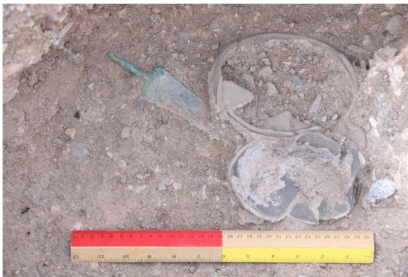
Figure 5. Dagger from burial G-1, Trench A.

remained intact since the deposition of the body, grave 1 was most presumably disturbed in the past. This inference is indicated by the commingling of bones, as well as accumulation of bones and artifacts in one part of the burial pit. This situation seems to be common for both cemeteries near Estark. At Estark 1, the majority of graves contained partially or completely disarticulated human remains along with the disturbed position of artifacts and damaged stone constructions covering the burial chambers.