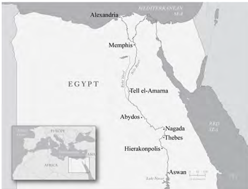
Figure 1. Amarna situated within Egypt, image credit K. Underwood.

Tell el-Amarna, or simply Amarna, is the archaeological site representing the ancient city of Akhetaten, Akhenaten's capital city, built to venerate the Aten ( Figure 1 ). Akhetaten was occupied for a short period of about 15–20 years during the reign of Akhenaten (c. 1353 BCE), built after he shifted the focus of the state level religion from the traditional pantheon of gods to focus on the Aten (Kemp 2012). The city was large, with 30,000–50,000 residents estimated and shows the hallmarks of a fully functioning urban area, with temples, housing areas, administrative offices, and craft production sites. After Akhenaten's death, the city was abandoned in short order, with the court returning to Memphis. Horemheb, who was a high official in Akhenaten's court and later king in his own right, eventually ordered the city dismantled (Kemp 2012). The abandonment and dismantling of the city likely did much to preserve it for 3,300 years.