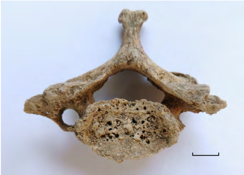
Figure 4. Spondylosis in a cervical vertebra (C7) from Barja 21/16. Scale bar 1cm.

Due to the secondary nature of the assemblage and post-mortem erosion of many of the elements, it was not possible to score pathological conditions in a systematic way. There was one older individual in 21/16, whose auricular surface was affected by porosity and marginal erosion (stage 8), accompanied by a very irregular retroauricular area. It is likely that the cervical, thoracic, and lumbar vertebrae exhibiting spondylosis and degenerative joint disease (DJD), especially clear in the lower cervical vertebrae (Figure 4), belonged to the same individual, together with the left first metacarpal showing eburnation and large osteophytes on its distal epiphysis. However, only slight and initial DJD was present on the right first metacarpal of the same individual. Very prominent palmar margins were noted on the intermediate phalanges, perhaps also from the same individual. Relatively well preserved cranial fragments of a younger child from the same assemblage exhibited early onset porotic hyperostosis and cribra orbitalia , but no other crania were available for scoring these conditions.