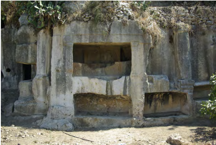
Figure 2. Necropolis of Barja.