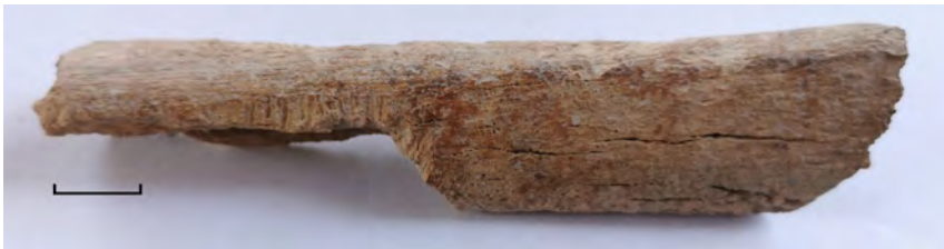
Figure 3. Rodent tooth marks on a bone fragment from Barja 21/19. Scale bar 1cm.

There are seven contexts where human remains were present and the minimum number of individuals (MNI) per context varied from one to fourteen. Overall the MNI is 33 (see Table 1) including 21 adults and 12 subadults. Neonate remains were not identified, but this may be an artifact related to their small size and higher risk of erosion. Both males and females were identified and no clear sex or age-at-death bias was observed, suggesting that the necropolis at Barja was a regular attritional cemetery. However, the retrieval bias is quite evident, as most identified fragments are tibiae and femora, with a much lower frequency of other long bones and very few minor or fragile skeletal elements noted in the whole assemblage.